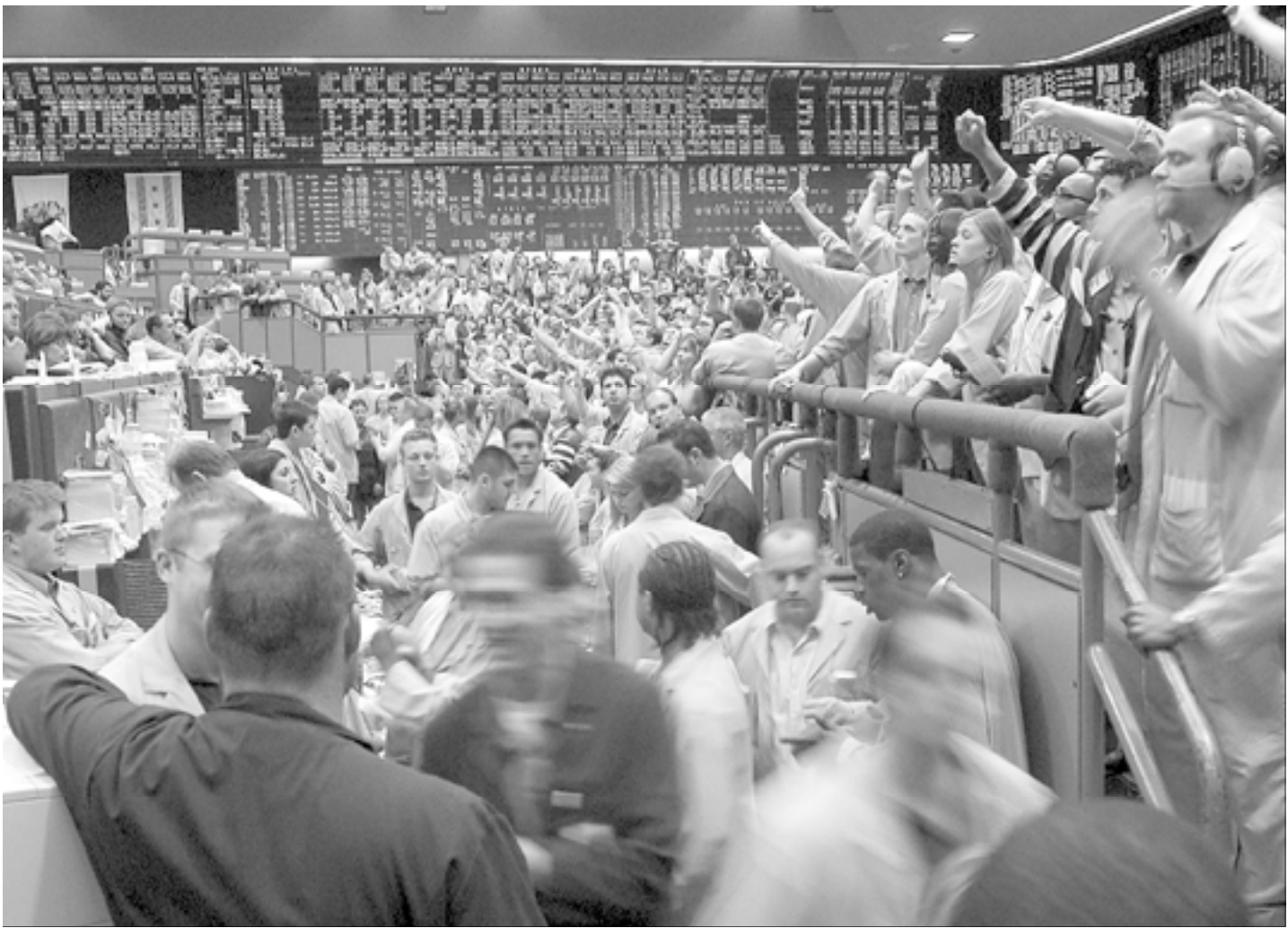
The dollar's value is determined in currency exchange markets like this one at the Chicago Mercantile Exchange, where the underlying value of futures contracts traded in a day can approach $80 billion.

currency fluctuations. Economists almost always base their forecasts of changes in market exchange rates on differences between national inflation rates. If a country has a higher rate of inflation than its trading partners, its currency generally will decline in the foreign-exchange market. But in the past several decades, currency values have overshot and undershot these expectations by much wider margins than before. Since the late 1990s, for example, inflation rates in the United States, and in Germany, France, and most other member countries of the European Union, have been roughly similar. But after the euro was launched at the beginning of 1999, the new currency depreciated by 30 percent. Since touching bottom in 2001, it has appreciated by nearly 50 percent. Earlier, in the 1970s, the dollar lost more than half its value relative to the German mark and the Japanese yen as investors became increasingly skeptical about the seriousness of the